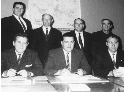
Elliston's first Town Council

On March 31 st , the community's first thirty-five street lights become operational.