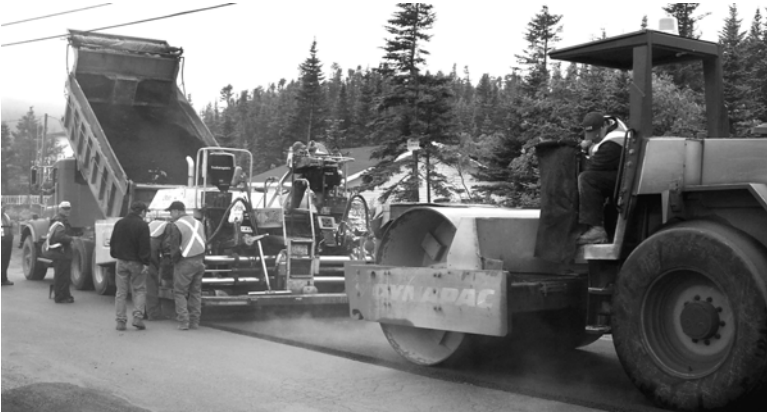
North Side being resurfaced on August 26 th 2005

2001 Population: There are approximately 360 residents at Elliston.