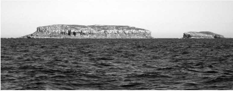
North & South Bird Island as viewed from the sea